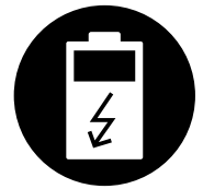
Low Energy Consumption