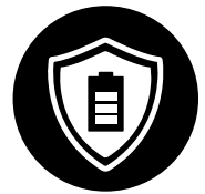
Battery Management System