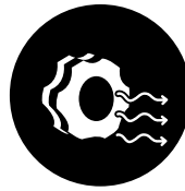
Ventilation Valve for Pressure Compensation