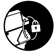
Theft Protection* 1